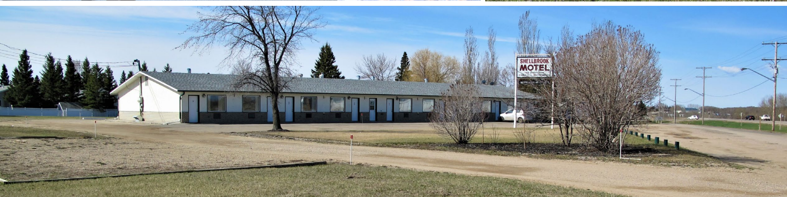
CLOCKWISE FROM TOP LEFT: Room with 2 Queen Beds // Office // Ice Cream Hut // Front View // Room with 2 Queen Beds