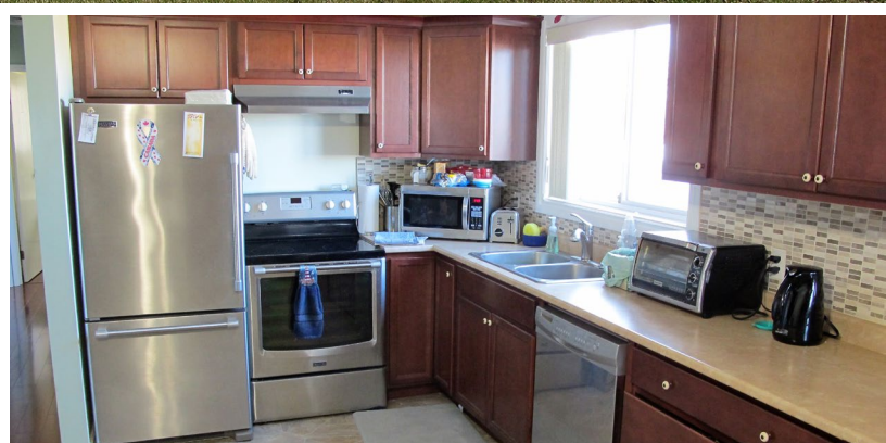
CLOCKWISE FROM TOP LEFT: Kitchenette // Room with 1 Queen Bed // Rear View // Owner/Manager Residence // Owner/Manager Garage